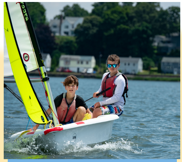
A summer of discovery and growth launches students into their school year.

What an incredible experience for our two boys.