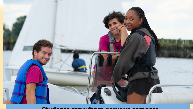
Students grow from nervous campers into confident, responsible staff.