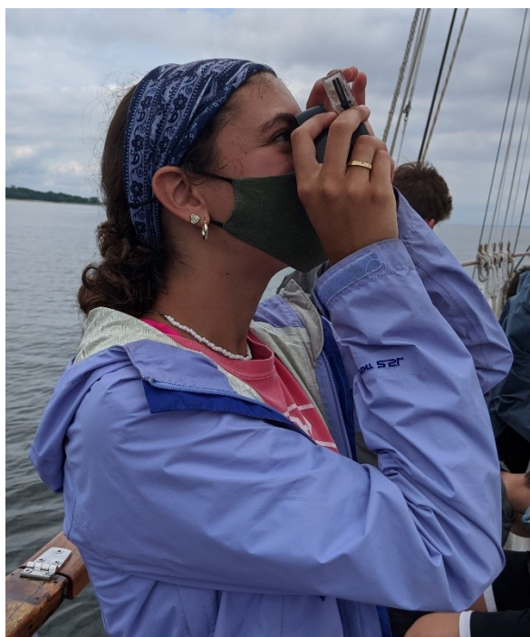
Identifying and documenting different types of plankton helped students understand the fragile Long Island Sound ecosystem.