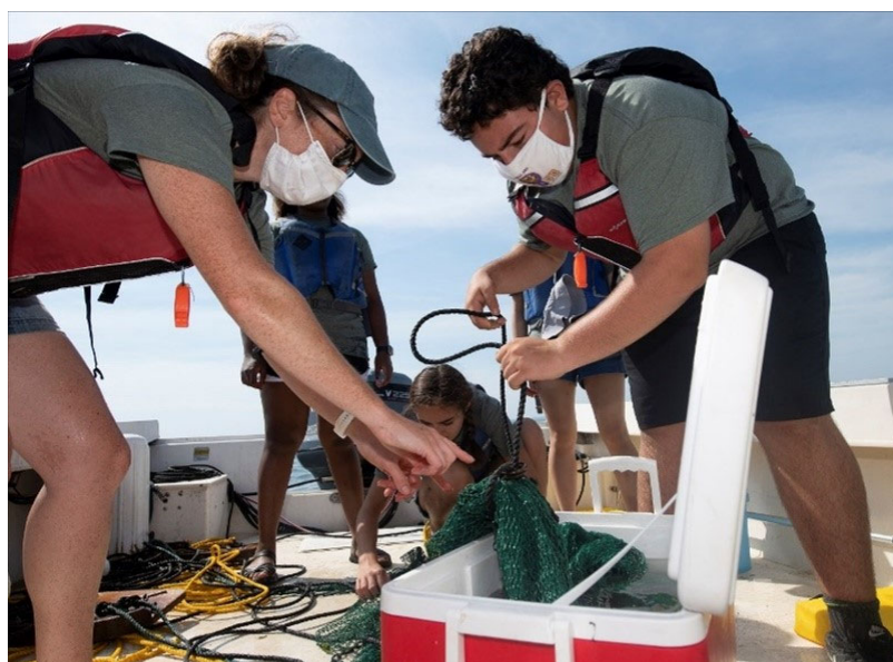
Deploying the trawl net on the Research Vessel gave SRI students valuable insights into animal populations.